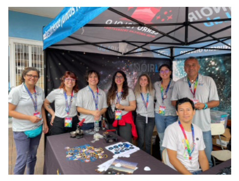
Promoting STEM Careers Interactions and presentations from various staff members provided an opportunity for students to learn about potential future opportunities for working with the next generation of large telescopes.

Exploring the Universe The hands-on workshops, visits, and planetarium shows of AstroDay provided the public with immersive opportunities to explore and learn about the Universe.